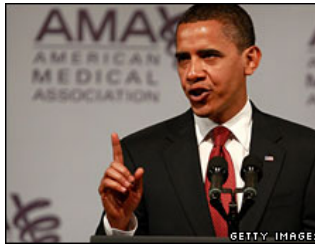
Mr Obama needs to win support from America's doctors

When Americans lose their jobs, the most crushing loss of all can be the access to family healthcare. And in this recession, the unemployment rate has now risen to 9.4%.