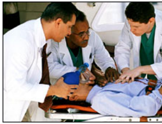
Emergency rooms in the US have to cope with uninsured patients

The key initiative from Senate Finance Committee Chairman Max Baucus could come as early as this week.